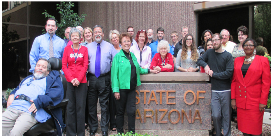
ADRE TEAM—DECEMBER 2014

Recently, ADRE received a thank you letter from the family they sponsored. The single mother stated, "I am writing this letter to say thank you! My daughter was so happy to unwrap all those gifts. It felt great to see her smile. I cried when I saw how much you and your team were able to do for us. Your gifts truly brought joy to my heart. Your team funded our whole Christmas. When I get the chance, I will pay it forward. Thank you from the bottom of our hearts for being a blessing in our life.."